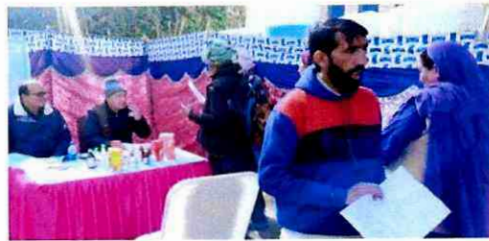
Kwar HE Project, CVPPPL organise follow up Medical Camp at village Padyarna

KISHTWAR, FEBRUARY 19: Kwar HE Project, CVPPPL, in association with District Administration Kishtwar and District Health department organised a follow up medical camp at the village Padyarna. It is a CSK Nippon India CSR 2022-23.