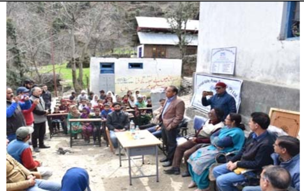
Handing over of items to Govt. Middle School, Gujjar Basti in presence of Naib Tehsildar Nagseni and ZEO Nagseni