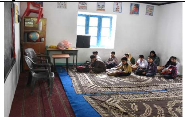
Govt. Middle School, Nagra (Kwar), Zone Nagseni depicting pre-activity scenario