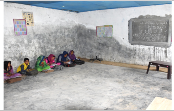
Govt. Middle School, Gujjar Basti (Padyarna), Zone Nagseni depicting pre-activity scenario