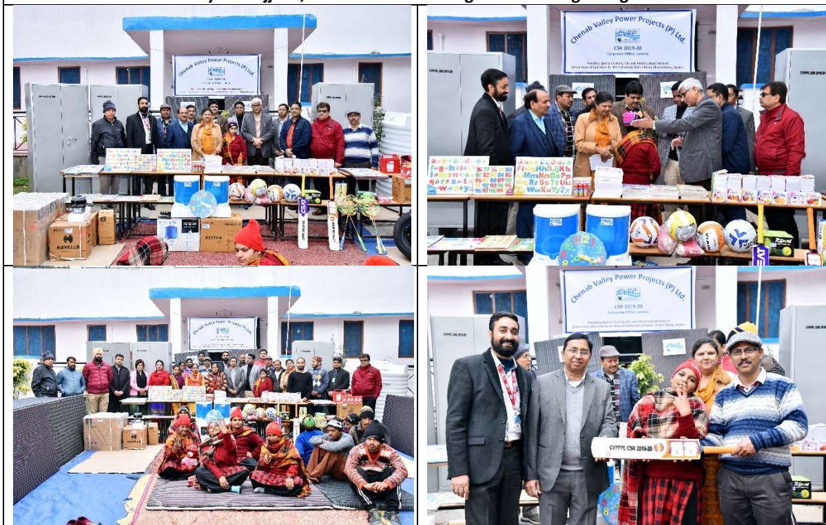
Handing over of items in presence of MD CVPPPL to Rotary Inner Wheel Home for Mentally Retarded Children, Channi Rama, Jammu