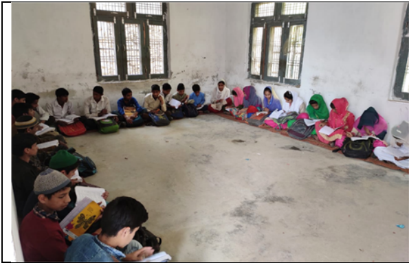
Govt. High School, Pathernakki, Galhar Bhata, Zone Nagseni depicting pre-activity scenario