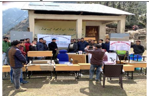
Handing over of items to Govt. Primary School, Phaath in presence of Tehsildar Nagseni, Naib Tehsildar Nagseni and ZEO Nagseni