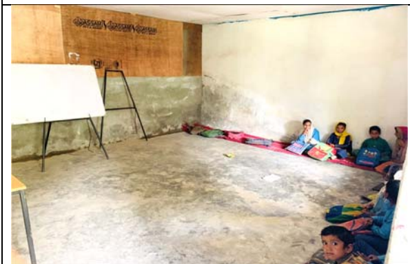
Govt. Middle School Keroo, Galhar Bhata, Zone Nagseni depicting pre-activity scenario