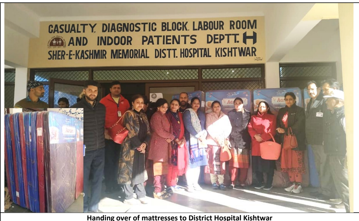
Handing over of mattresses to District Hospital Kishtwar