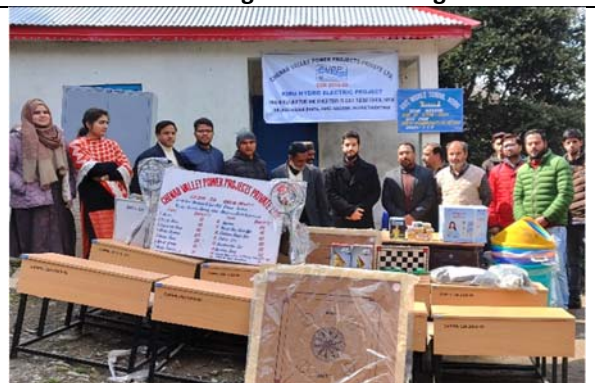
Handing over of items to Govt. Middle School Keroo in presence of Tehsildar Nagseni, Naib Tehsildar Nagseni and ZEO Nagseni