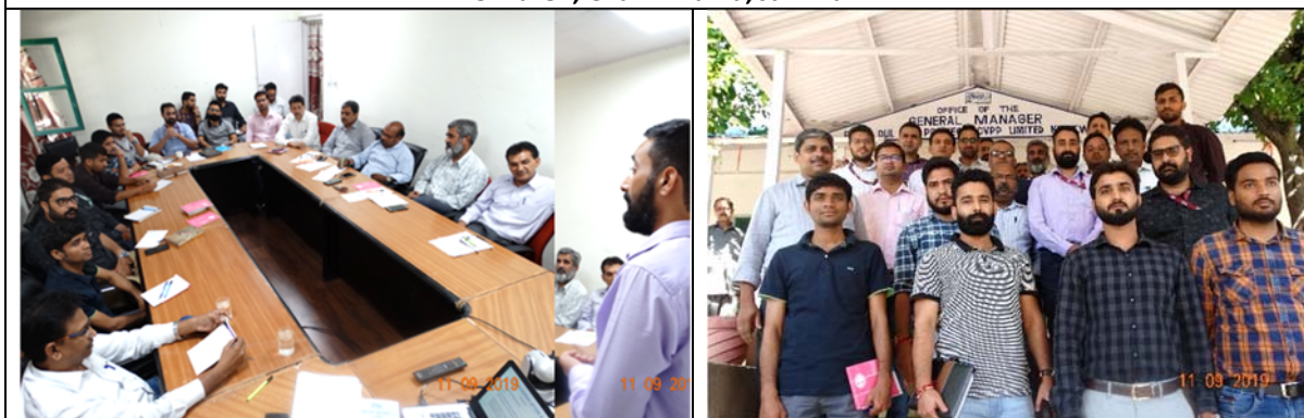
Training Programme on CSR organised by Nodal Office (CSR) at Kishtwar