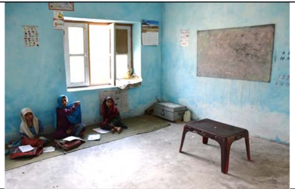
Govt. Primary School, Rashgware, Zone Nagseni depicting pre-activity scenario