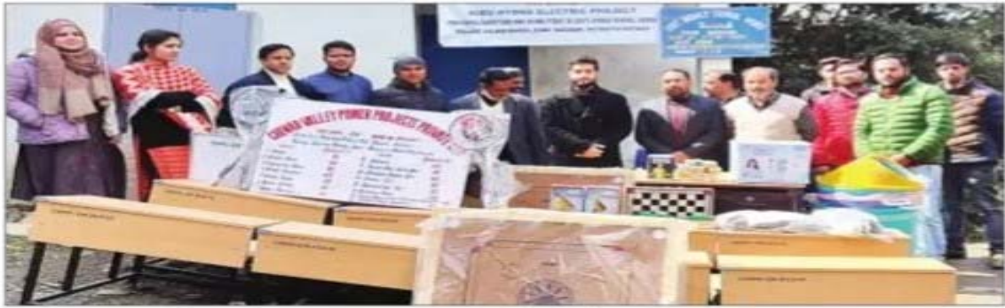
स्कूल प्रबंधन को सामग्री उपलब्ध करवाते सी.वी.पी.पी. के अधिकारी।