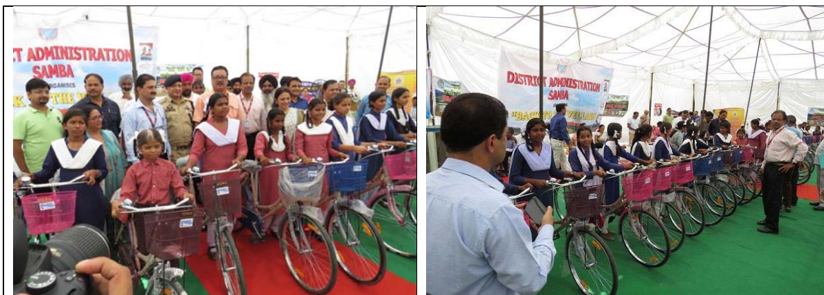
Handing over of bicycles to BPL girl students by Chairman CVPPPL (Principle Secretary, Industries & Commerce Department, J&K) in presence of DC Samba and other officers from District Administration at Panchayat Chajjwal, District Samba during Back to Village Programme