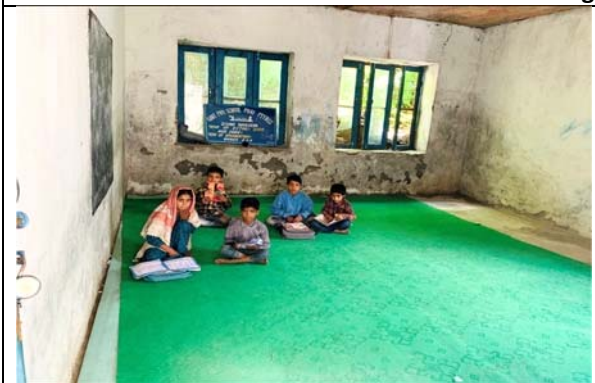
Govt. Primary School, Phaath (Piyass), Galhar Bhata, Zone Nagseni depicting pre-activity scenario