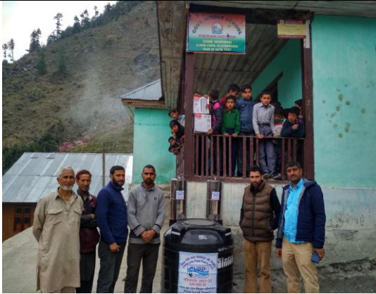
Govt. Middle School Pinjrari, Village Sounder