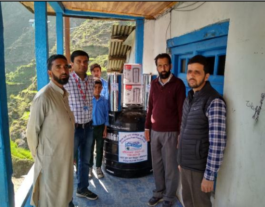
Govt. Upper Primary School Khripokhnoo, Village Lopara