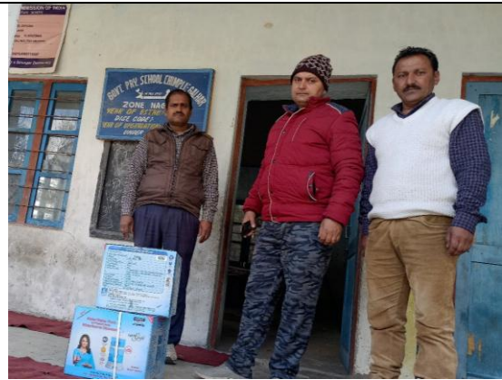
Govt. Primary School Champli, Village Galhar