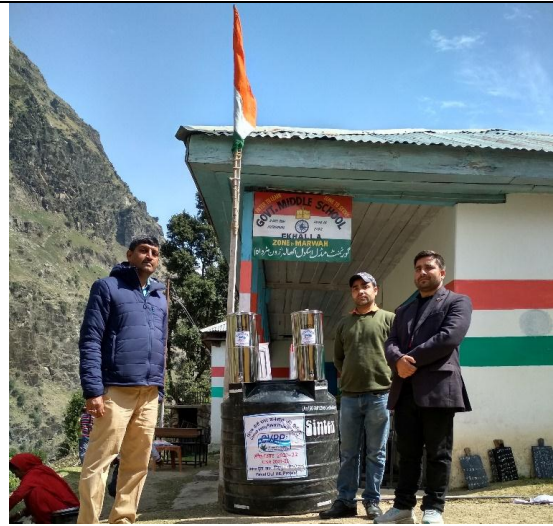
Govt. Middle School Ekhala, Village Sounder