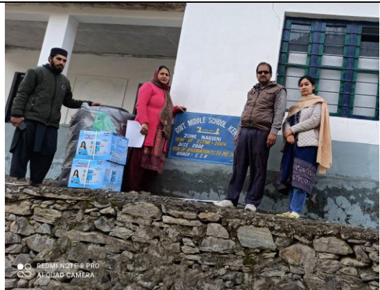
Govt. Middle School Kiru, Village Galhar