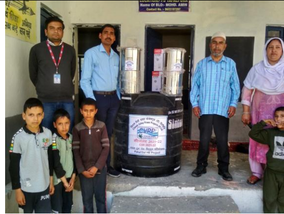
Govt. Middle School Tapalpura, Village Dool