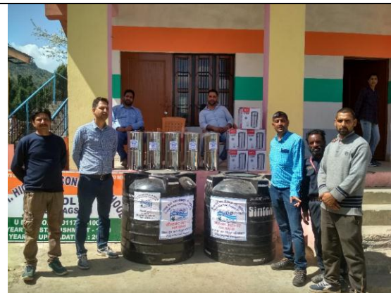
Govt. Higher Secondary School Dool, Village Dool