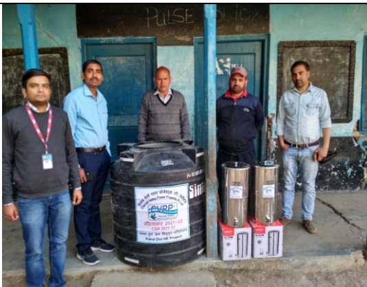
Govt. Middle School Malikpora, Village Dool