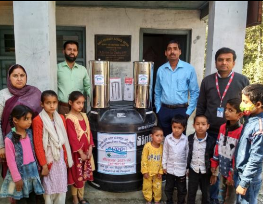
Govt. Primary School Dassa, Village Dool