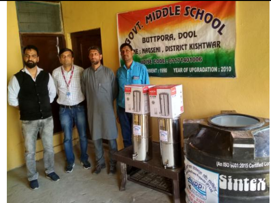
Govt. Middle School Buttpora, Village Dool