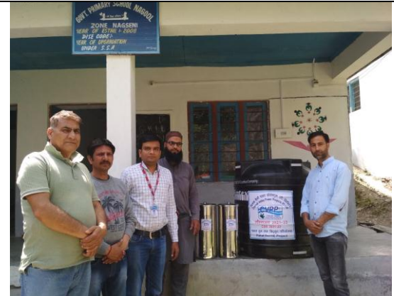
Govt. Primary School Nagool, Village Dool