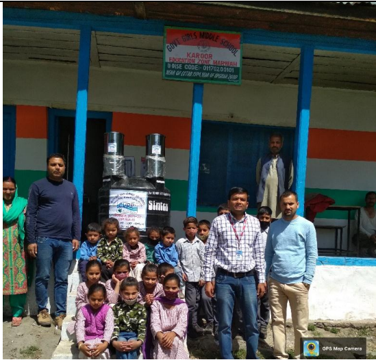
Govt. Girls Middle School Karoor, Village Sounder